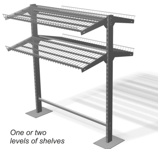
One or two levels of shelves