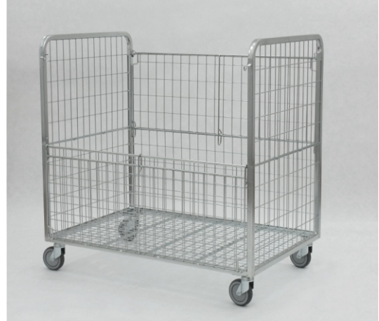
Unused containers can be folded at its mid-height and stacked one onto another: