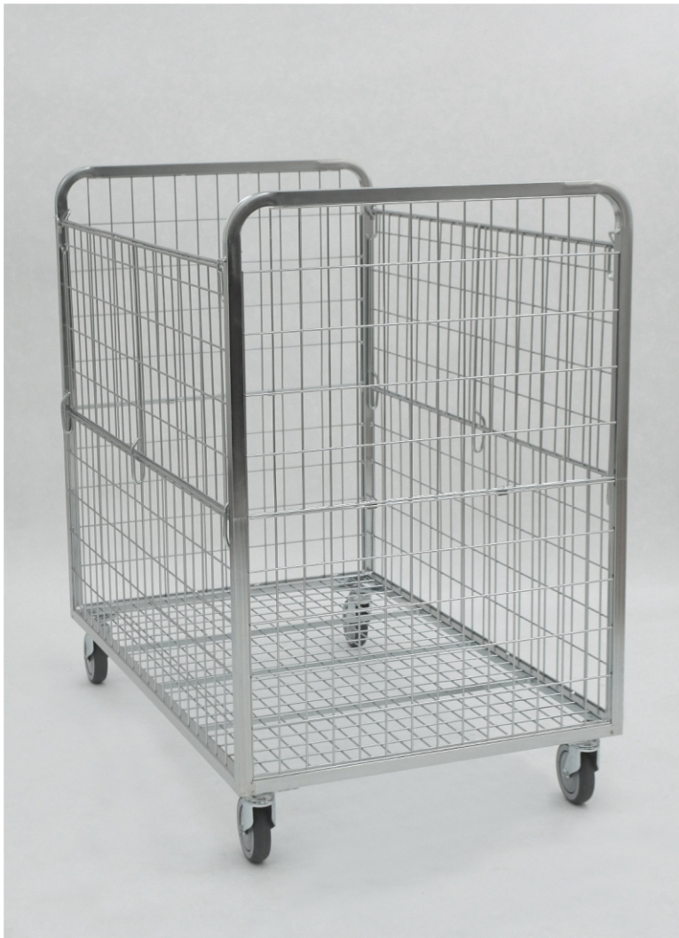
Hinged hatches in the container: