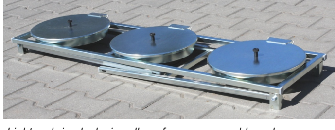
Light and simple design allows for easy assembly and distribution of the rack.

The way of mounting the garbage sacks with rubber putted on the rim is very quick and simple.