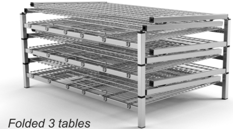
Folded 3 tables