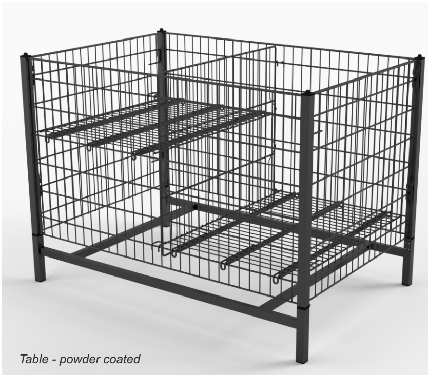
Table - powder coated