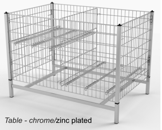
Table - chrome/zinc plated

Display tables allow for presentation of small and unwieldy goods. The construction ensures that the display table is very stable and highly resistant to damages. The bottom reinforced with flat irons allows for exposition of goods with various sizes and weights. There is possibility of adjust the height of the bottom on two different levels at the same time. Divider and bottom split into two separate parts allow the exposure of different types of assortment at the same time. The construction of the table allows for easy folding and unfolding. Unused tables can be quickly folded and stacked on top of each other, so they don't take up excessive warehouse space.