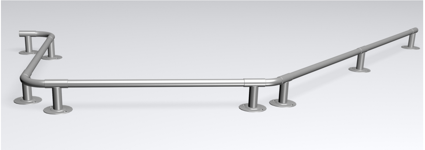
DIAGRAM OF FENDER'S ELEMENTS: