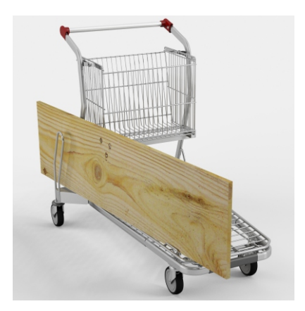
The additional set mounted on the side of the trolley is intended for transport of items with dimensions not exceeding 1000mmin height and 2400mm in length, ie.: tubes, strips, boards, doors